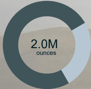
2025A Gold Equivalent Production

Two top tier (1) mines – Tasiast & Paracatu – account for >50% of production and world class development projects in attractive jurisdictions