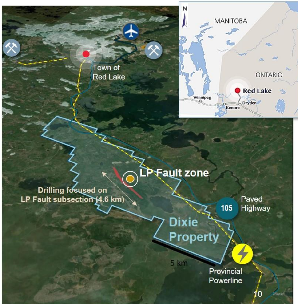
Figure 1. Map of Dixie property and LP Fault zone location 4 .