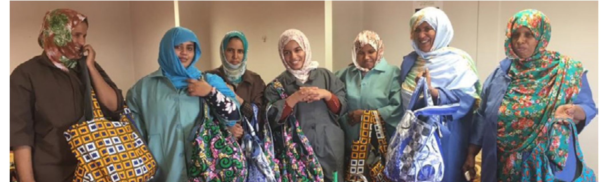
Members of the Tasiast Women's Cooperative.