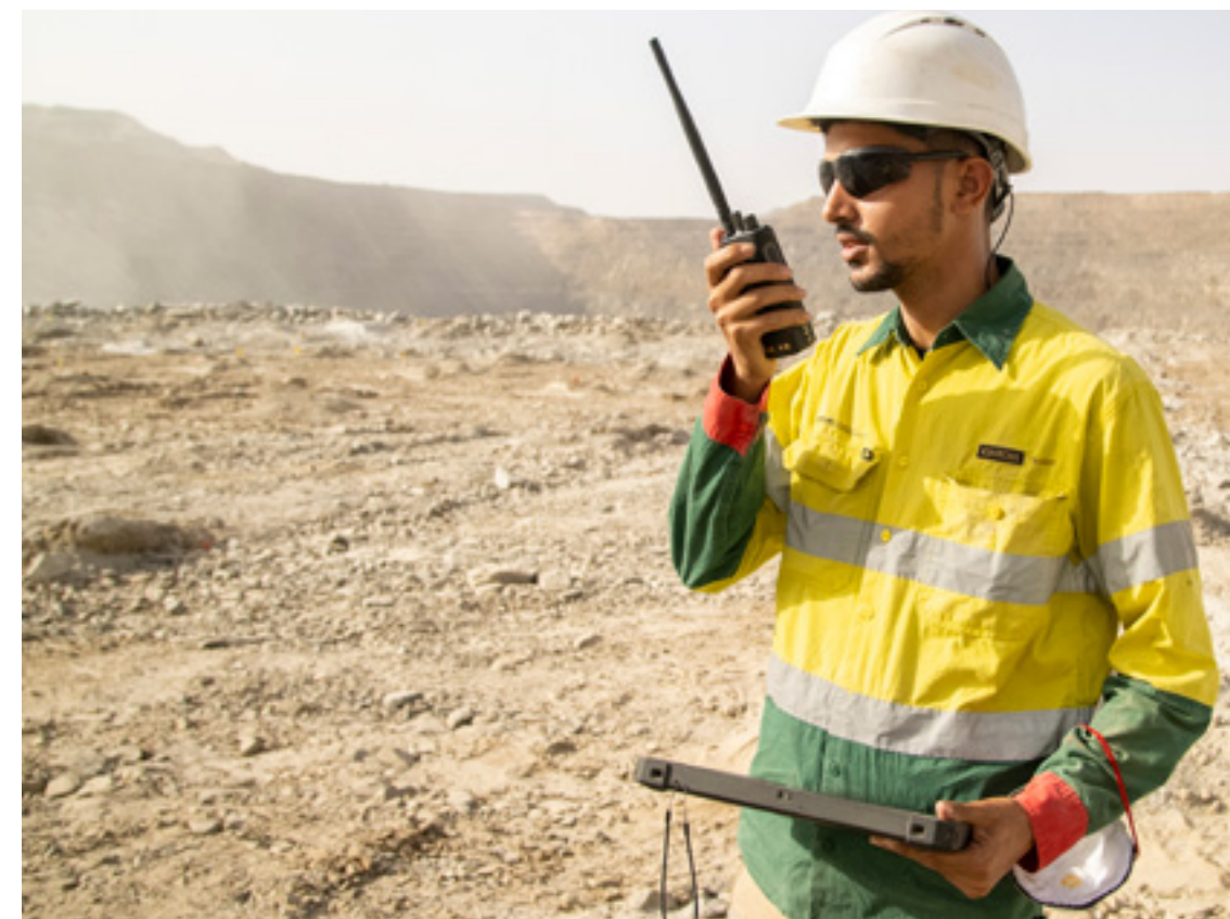
At Tasiast, an employee in an active mining area.