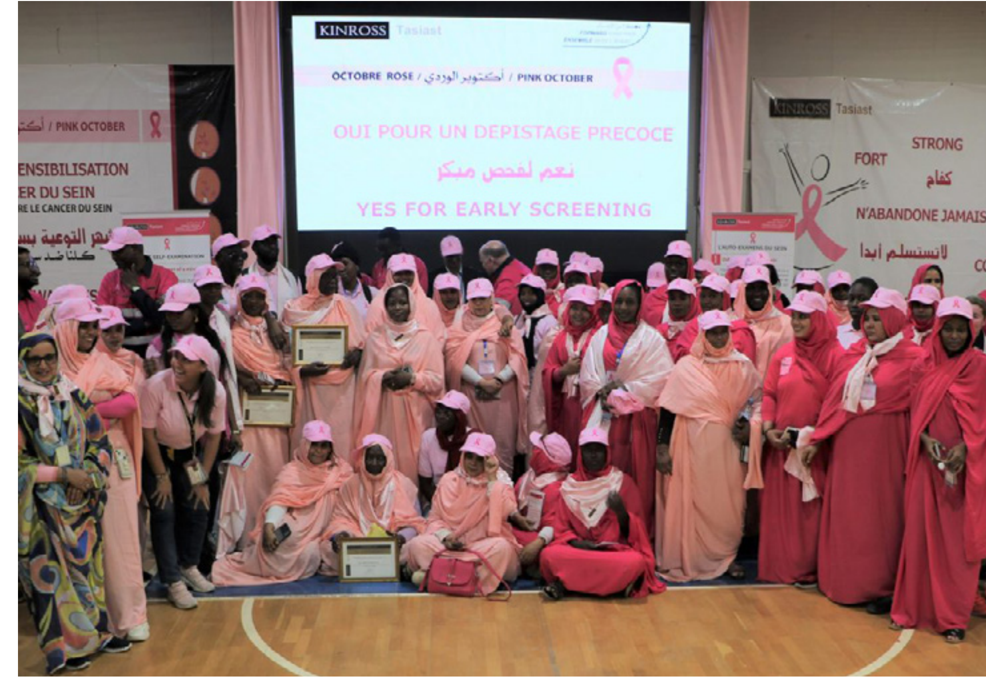
Right: Approximately 100 employees celebrated International Women’s Day and 500 participated in “Pink October” for breast cancer awareness.

With many of our sites in remote locations, ensuring that we have the best medical capabilities to protect and meet the needs of our workforce is an ongoing priority. Tasiast’s medical services are provided by physicians and nurses located at site. In 2024, we enhanced medical capabilities for employees and business partners, integrating gynecological and dental services at Tasiast’s onsite clinic.