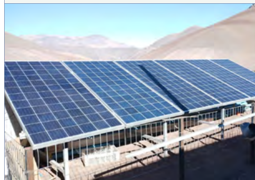
NUMBER OF SOLAR PANELS INSTALLED PER COMMUNITY

30 Solar Panels have been installed in six Colla communities, providing energy for domestic use.