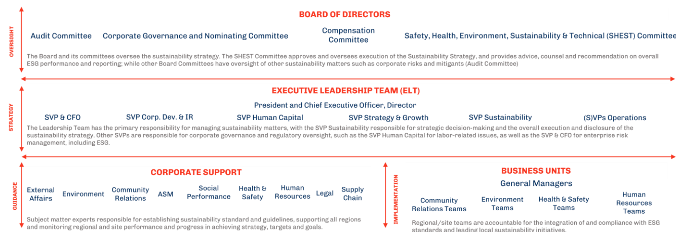
Table 1. Calibre’s Climate Governance Structure