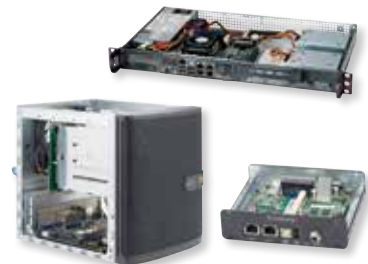
IoT Solutions Edge Computing to the Cloud