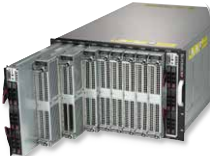
8-way MP Solutions Optimized Enterprise Computing