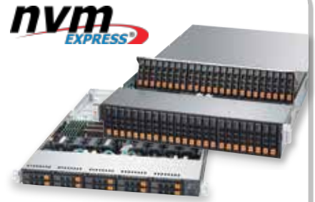
All-Flash NVMe Solutions Best IOPS, Latency, and Selection