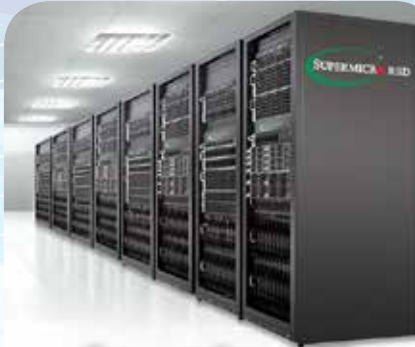
Supermicro RSD Next Generation Datacenter Architecture