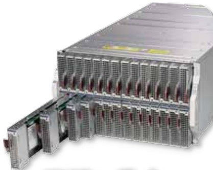
6U MicroBlade Ultra High Density up to 0.1U per node