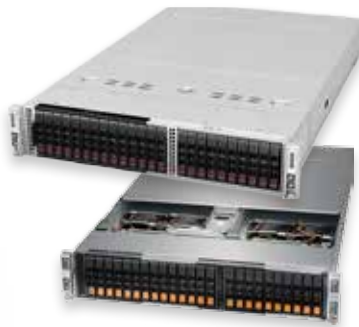
New! BigTwin™ No compromise Multi-Node System