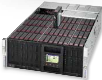
SuperStorage 4U 60/90-Bay Storage Server/JBOD