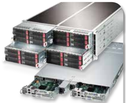
Twin Architecture Density Optimized Datacenter/HPC Solutions