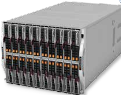
New! SuperBlade® Up to 10 MP or 20 DP Nodes in 8U