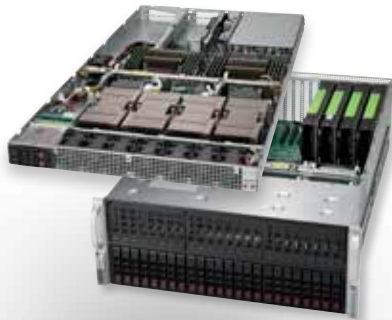
GPU Solutions For Machine and Deep Learning