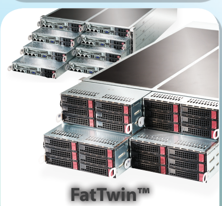
8 Hot-Swap 3.5" HDDs per 1U