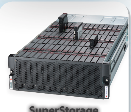
SuperStorage 4U 90/60 Hot Swap HDD Bays